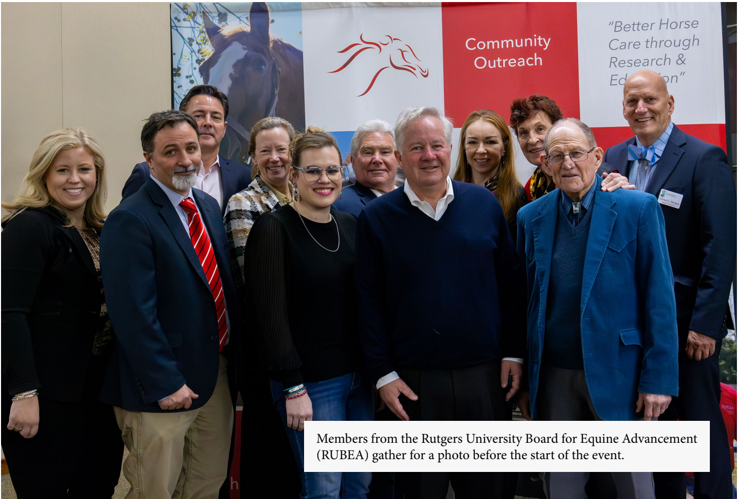
Members from the Rutgers University Board for Equine Advancement (RUBEA) gather for a photo before the start of the event.