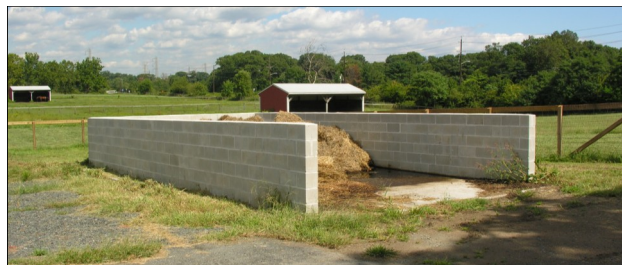
New storage facility

In 2005, we began working closely with the USDA-Natural Resources Conservation Service to design and build the new structure. It measures 25 by 30 feet and has the capacity to hold manure and bedding from 17 horses kept in stalls for 24 hours a day for up to 45 days.