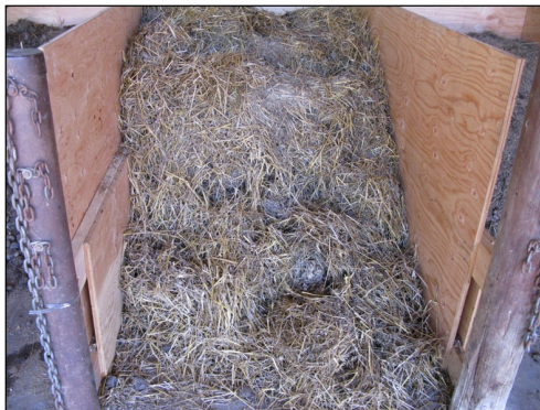
Straw before (above) and after (below) 90 days of composting

On-farm composting is only a solution when done correctly. If you do not have the time and interest to compost properly, then other methods of manure disposal might be a better option.