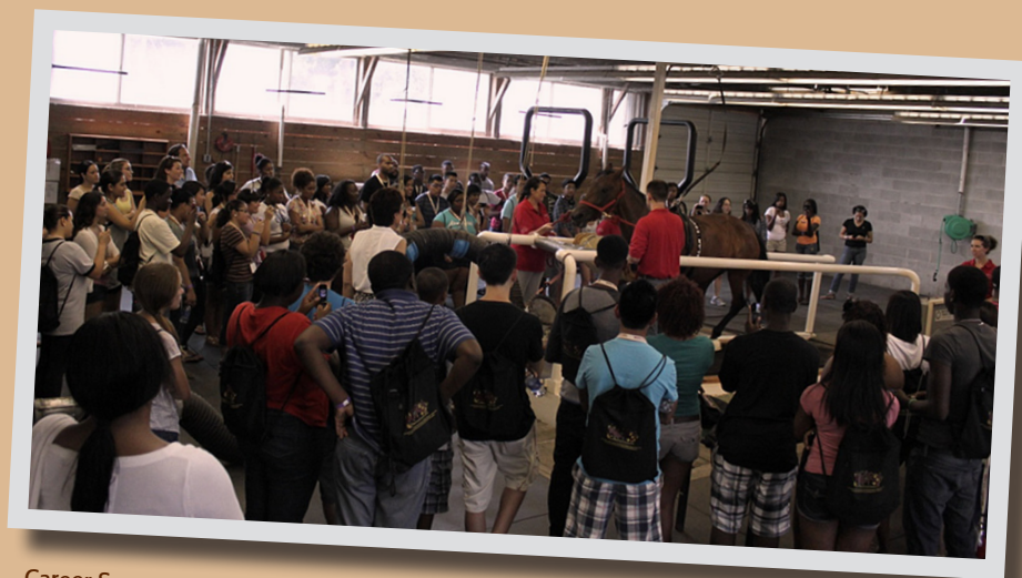
Career Summer Institute and Open House guests

On Tuesday, July 12, the Equine Science Center hosted an Open House in conjunction with the Career Summer Institute (CSI) at the Equine Exercise Physiology Laboratory on College Farm Road on the George H. Cook Campus in New Brunswick from 11:00 pm to 1:00 pm. The CSI is a weeklong residential program of the Rutgers School of Management and Labor Relations, designed to develop career assessment and exploration through various interactive workshops for high school students from throughout the state of New Jersey.